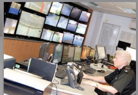
Above: The control room before the refurbishment Left: The new security control room at Aston University