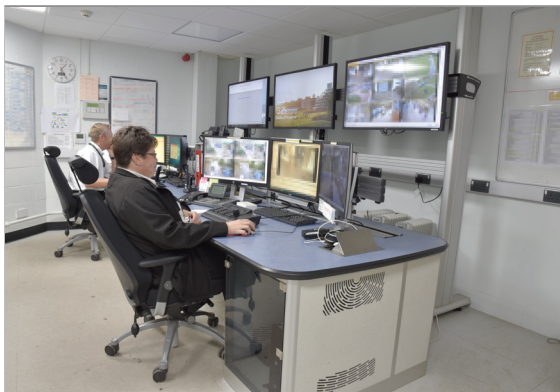
Above: The main control room completed in 2015 still looking good in 2018 Right: The Sainsbury Centre control room completed in 2018