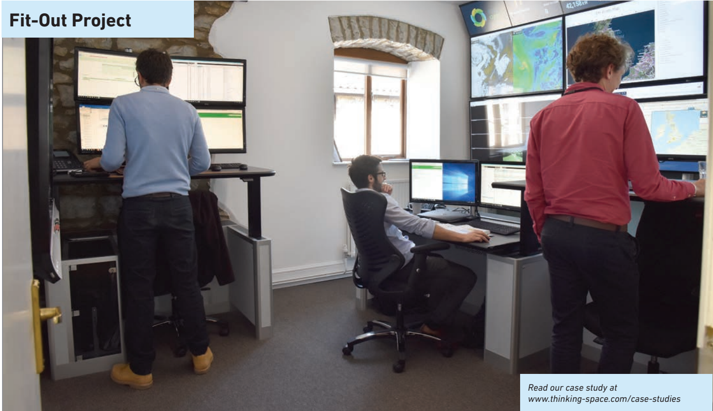
Read our case study at www.thinking-space.com/case-studies