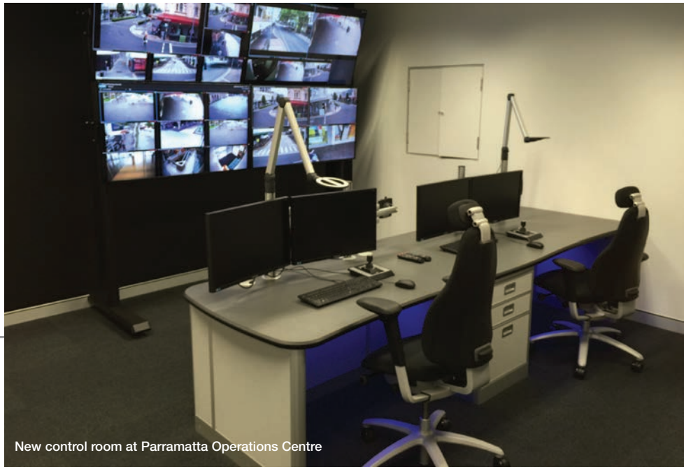
New control room at Parramatta Operations Centre