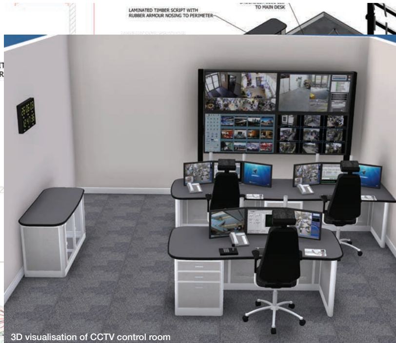
3D visualisation of CCTV control room